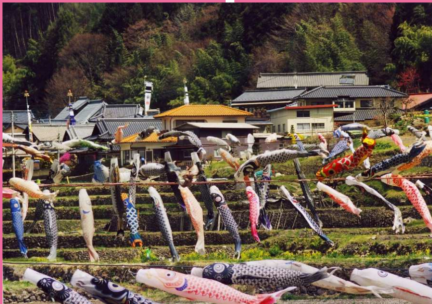
Carp streamer in golden week

their appreciation to nature and plants. The last holiday in Golden Week is Children's Day (Kodomo-no-hi) on May 5th. It's also called “Boys' Festival” (Tango-no-sekku) - a day to pray for the healthy growth of boys. On this day, Japanese families usually display a helmet replica or samurai dolls inside their houses and hang up carp streamers outside. The carp symbolizes successes of children in their future.