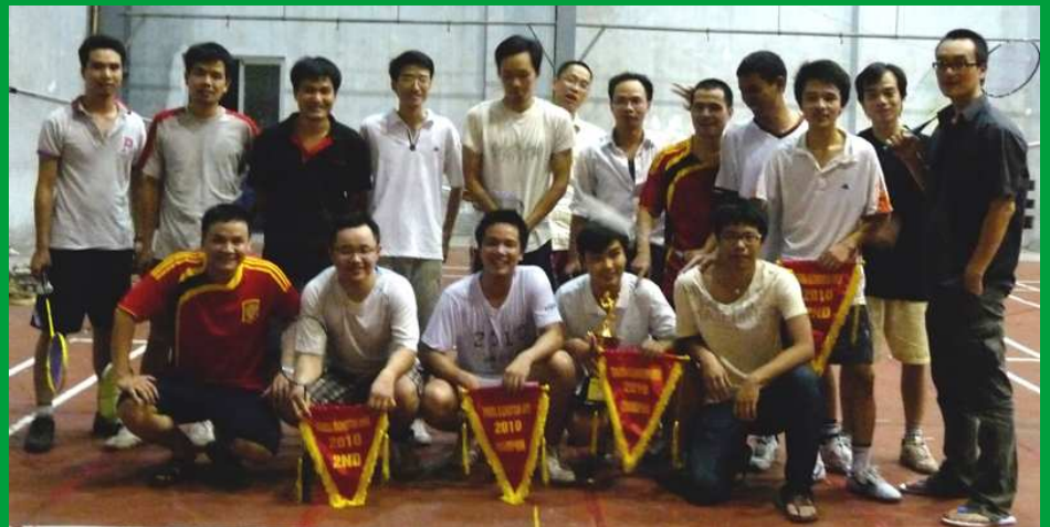
TSDV badminton team

includes 12 members, with 4.5 millions Funds per quarter, active on Tuesday and Thursday every week at The police stadium. The activities of the club: split up teams, a team is a couple and competes. This club suites to anyone. If you don't play it, you can play it well by practicing hardly and you need some major skills as tee, beat ball and passing. Although just