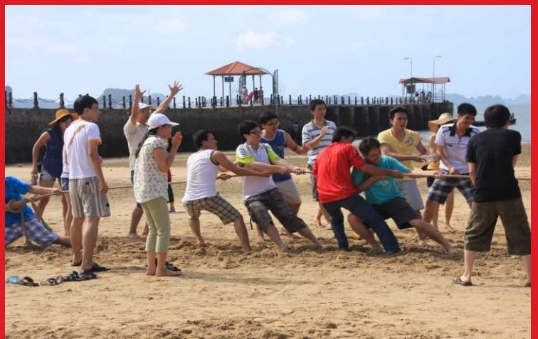
Tug of war game

We checked out at 11:30 AM then had lunch. 13 PM, the car rolled back to Ha Noi. What is a great trip in Ha Long Bay! Memories with everyone will remain forever on my mind. Definitely I will be back here one day. So, how about you? If you are considering where to travel, just choose Ha Long Bay in Vietnam. Come and get your own feeling!