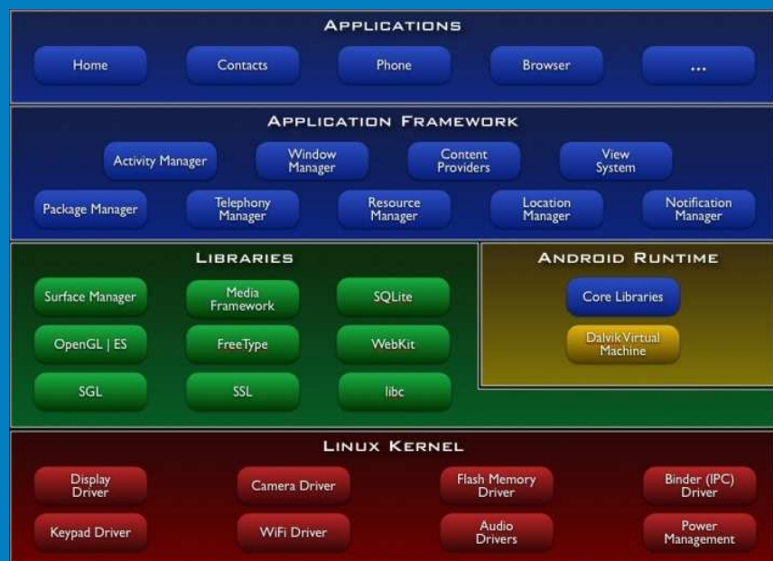
The picture of Android

As you know, nowadays (the) Java language is popular (all) over the world. This yellow color(part) “Dalvik virtual machine” is the bridge for the Java applications to run in C/C++ libraries.